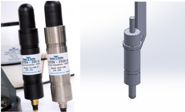
Figure 1: OceanSonics icListen Smart Hydrophones (left) used as templates for the CAD design (right) used in the numerical domain.