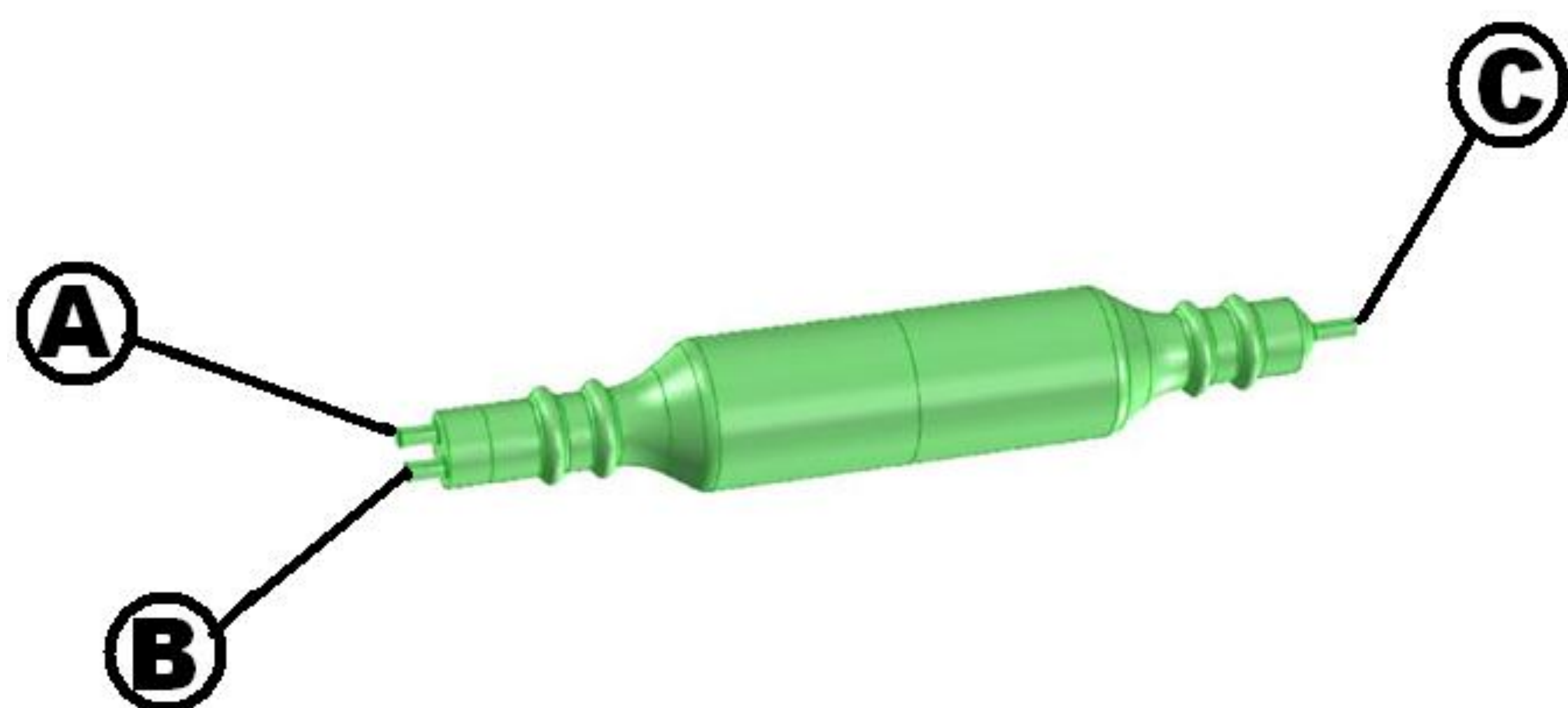
Figure 2. 3D design of diluter: (a) inlet of clean air; (b) inlet pollute air ;(c) outlet of mixture.